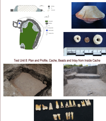
Test Unit 8 - Plan and Profile, Cache, Beads and Inlay from Inside Cache Test Unit 10 - Pinkish Floor; Test Unit 22 Burned Floor, Walls and Bench; Test Unit 11 - Inlaid Teeth

During the 2011 field season, a total of 28 Test Units were undertaken, these consisted of 14 Structures and 14 Landscape features. Artifacts mainly consisted of ceramics and lithics, but also obsidian, groundstone and shell artifacts were recovered, as well as human remains and associated grave goods. Soil samples were also collected where appropriate for future analysis. Carrying out excavations also allowed us to check the veracity of the 2010 sketch maps for accuracy. The biggest anomaly we found was Test Unit 8, which, although appeared to be a rectangular mound, was in fact an oval shaped building with curved walls containing a Late Pre-Classic/ Early Classic lip-to-lip cache in its foundations. This highlighted the importance of excavation alongside survey, as even the most thorough survey cannot give a completely accurate view of what lies beneath the ground in the archaeological record. Other notable finds from the 2011 season included a multiply burned and re-plastered room (Test Unit 22), human remains with filed and inlaid teeth (Test Unit 11) and a pink hueed floor (Test Unit 10)