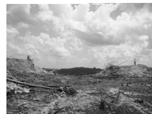
Example of 2010 Sketch Map; Selection of Artifacts from Surface Collection; Freshly Burned and Cleared Fields